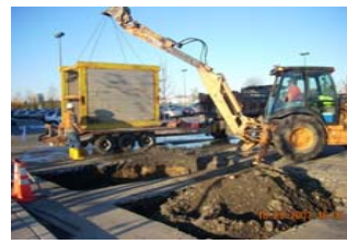
Emergency Water Main Breaks