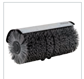
□ Snow sweeper