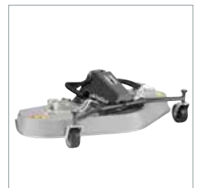
■ Rotary/mulch mower 1500