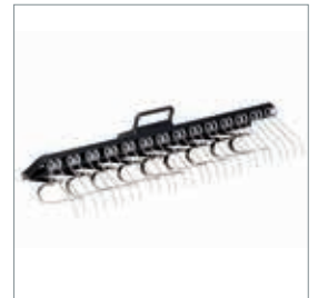
■ Environmental rake