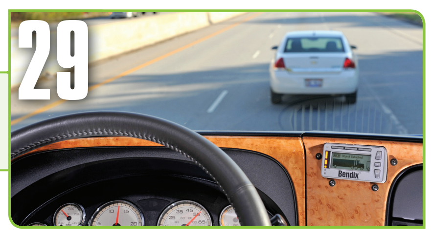
MAINTAIN AN EXTENDED FOLLOWING DISTANCE.

Use truckstops atop hills. Driving uphill toward the truckstop allows natural deceleration, and going downhill to re-enter the highway requires less fuel.